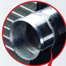
RIBBED BILLET OUTLET PREVENTS HOSE BLOW-OFF.

So order your kit now! Options available for different year models—call us on (07) 5547 1600 for details.